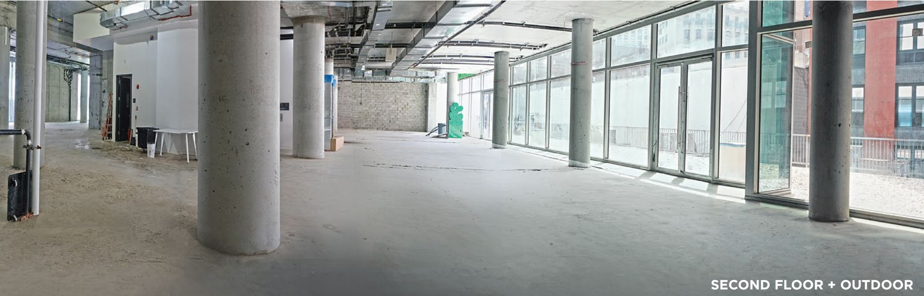
SECOND FLOOR + OUTDOOR